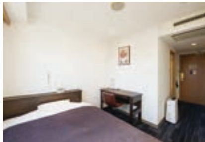
Extra single room