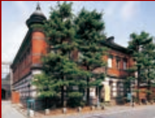
▲Akarenga Local history museum