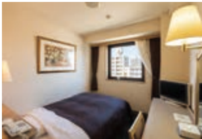
Deluxe single room