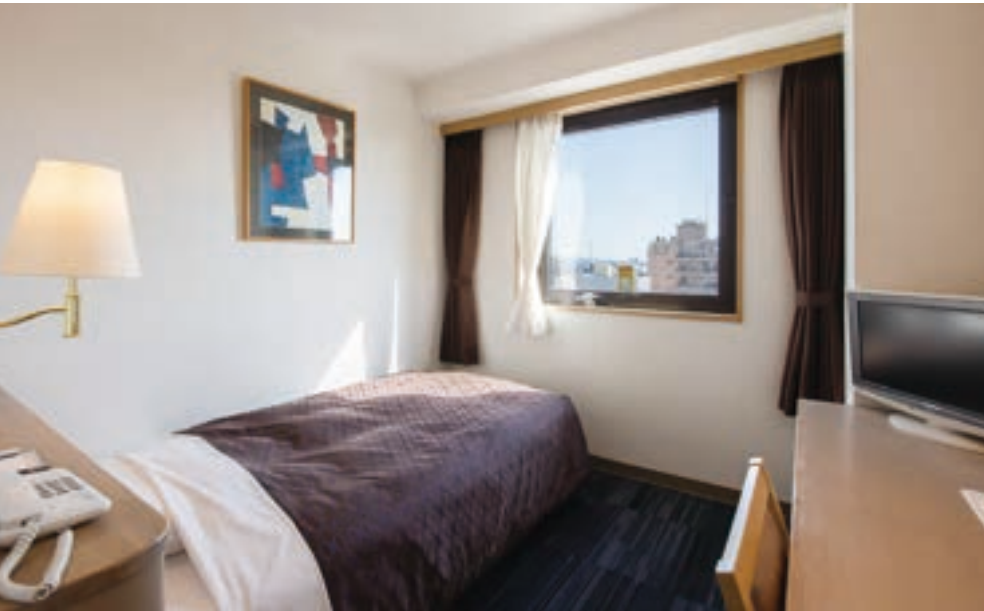
Standard single room