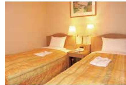
Standard twin room