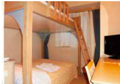
Double deck bed room for family