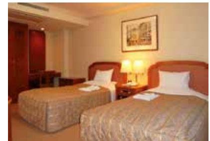
Deluxe twin room