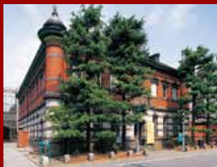
▲Akarenga Local history museum