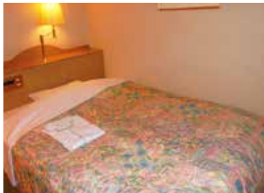
Deluxe single room