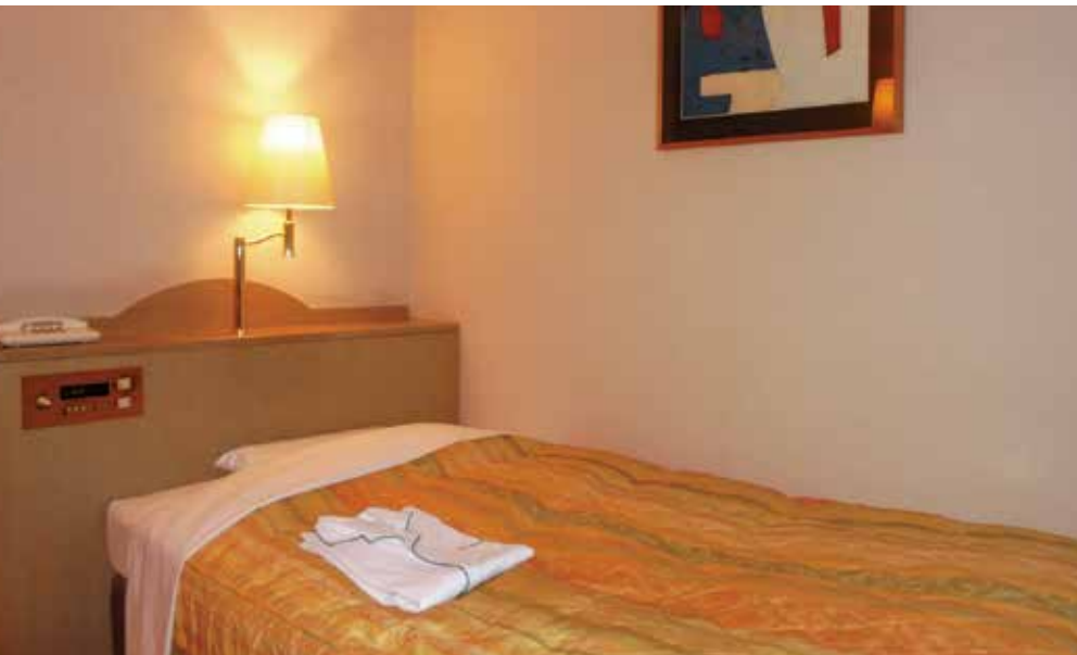
Standard single room